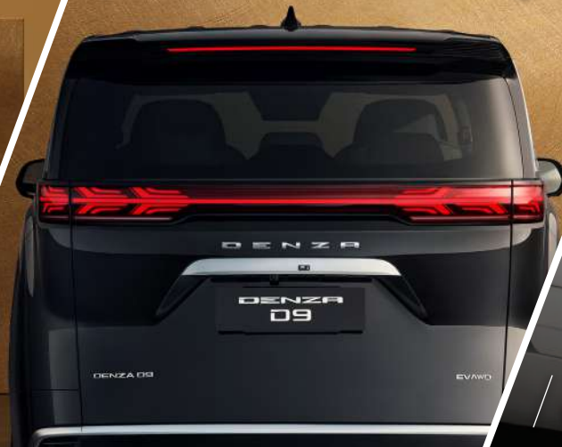
Time Travel Star Feather Tailights