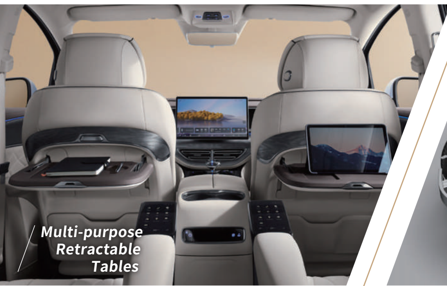
Multi-purpose Retractable Tables