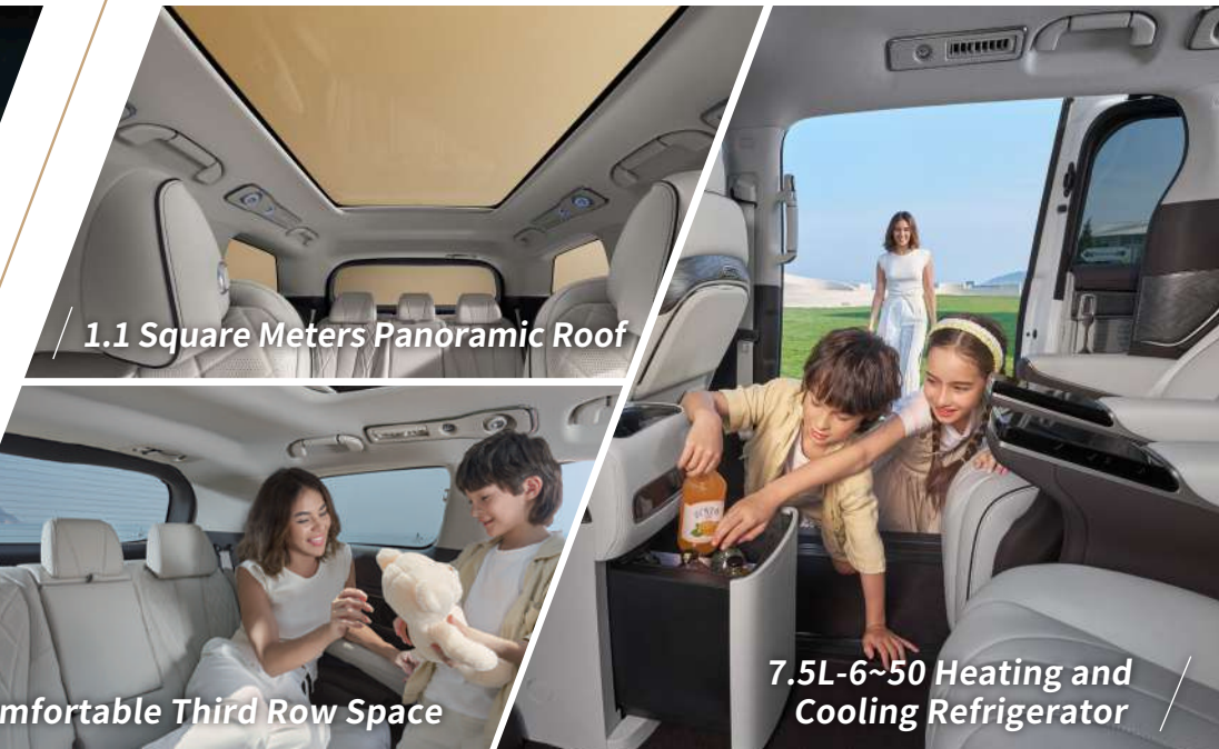
Comfortable Third Row Space