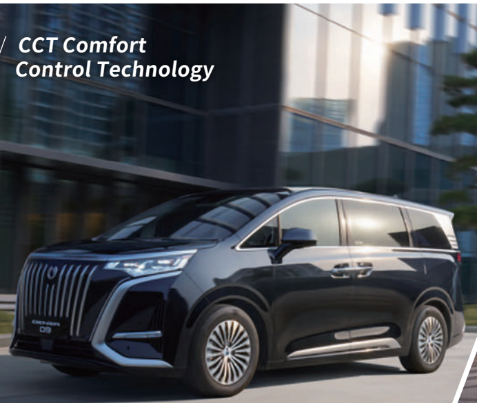
Waistline of Meteor Track