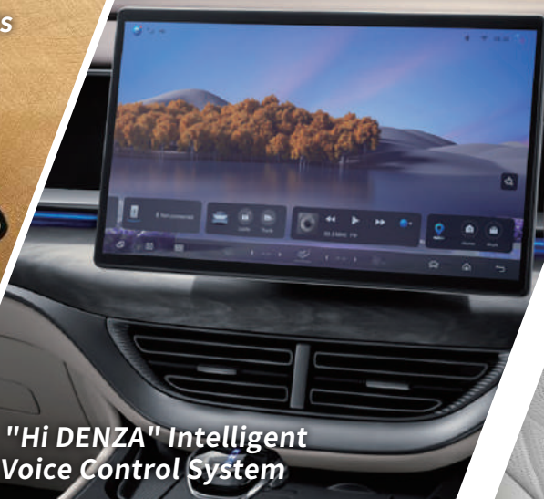
"Hi DENZA" Intelligent Voice Control System