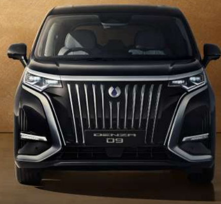
Motion Front Grill Blade