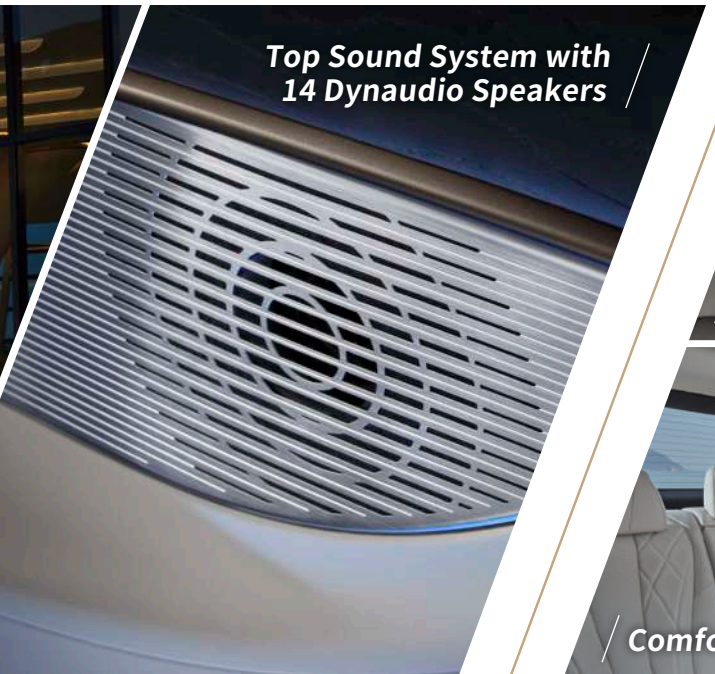
Top Sound System with 14 Dynaudio Speakers