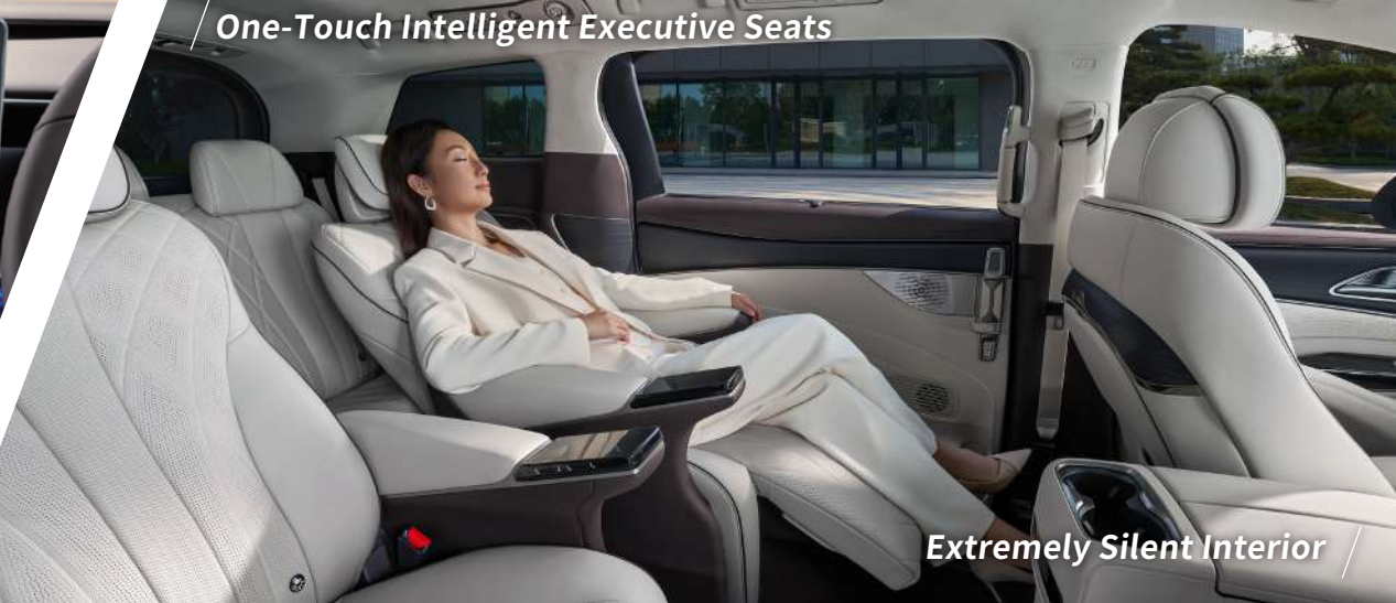
Extremely Silent Interior