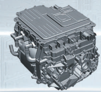
8-in-1 Electric Powertrain